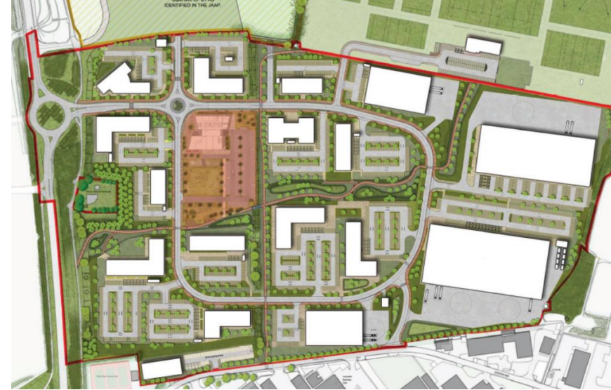
MAP OF AIRPORT BUSINESS PARK (LAUNCHPAD SITE IN RED)