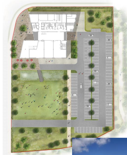
AERIAL VIEW OF LAUNCHPAD SITE