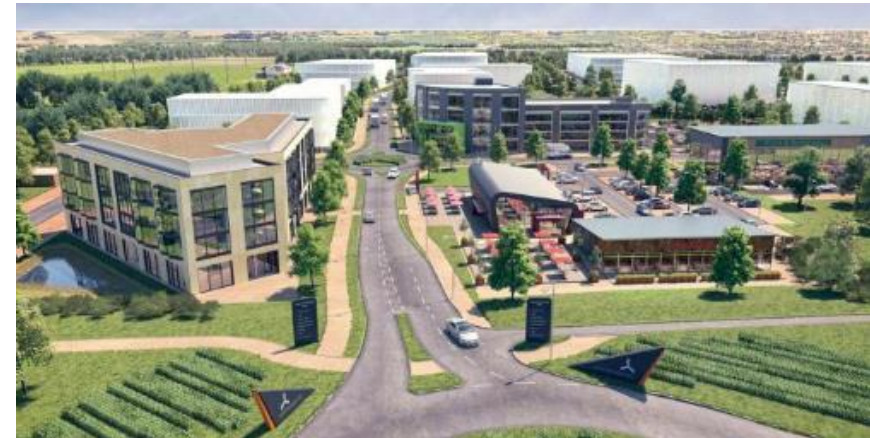
VISUALISATION OF AIRPORT BUSINESS PARK